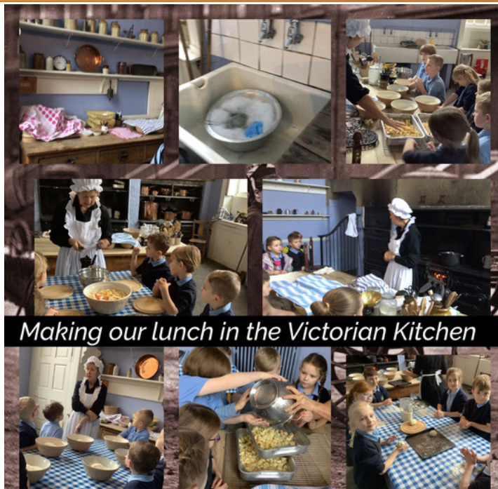
Making our lunch in the Victorian Kitchen

Class 4 really enjoyed their trip to Cannon Hall where they did many activities such as making food in the Victorian kitchen, having a tour of the house, making butter and making lavender bags. Class 3 will be visiting on the 19th January and Class 5 will be visiting on the 7th February.